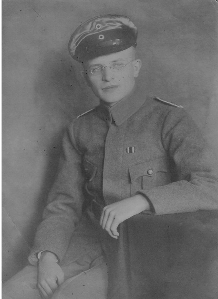
25. On furlough (September 1918)