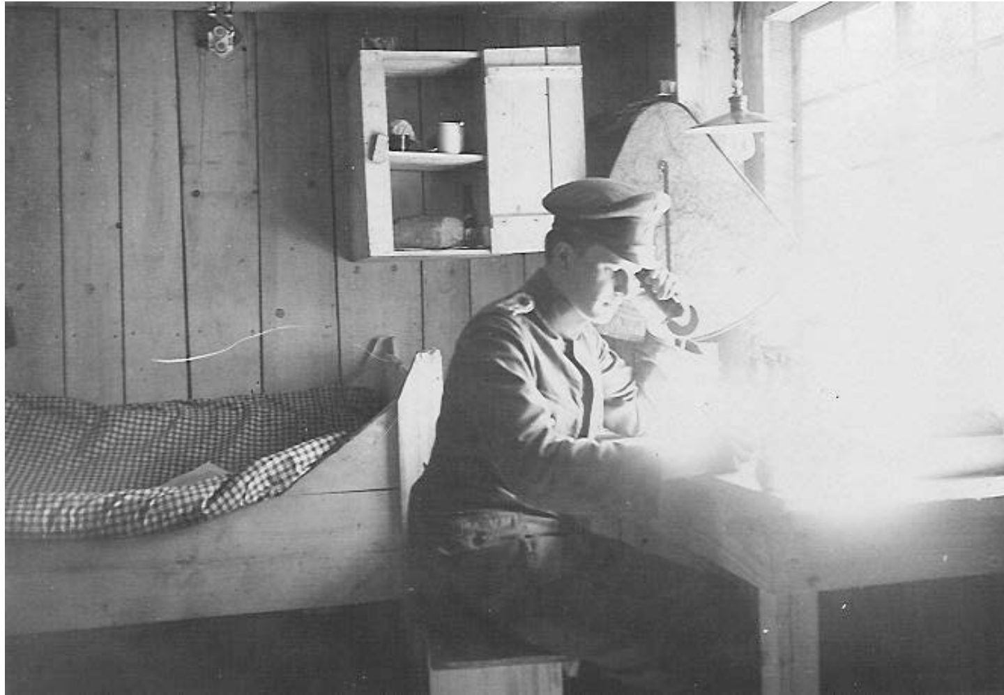
24. Telephoning from bunker just before a direct hit by an enemy shell (September, 1918)